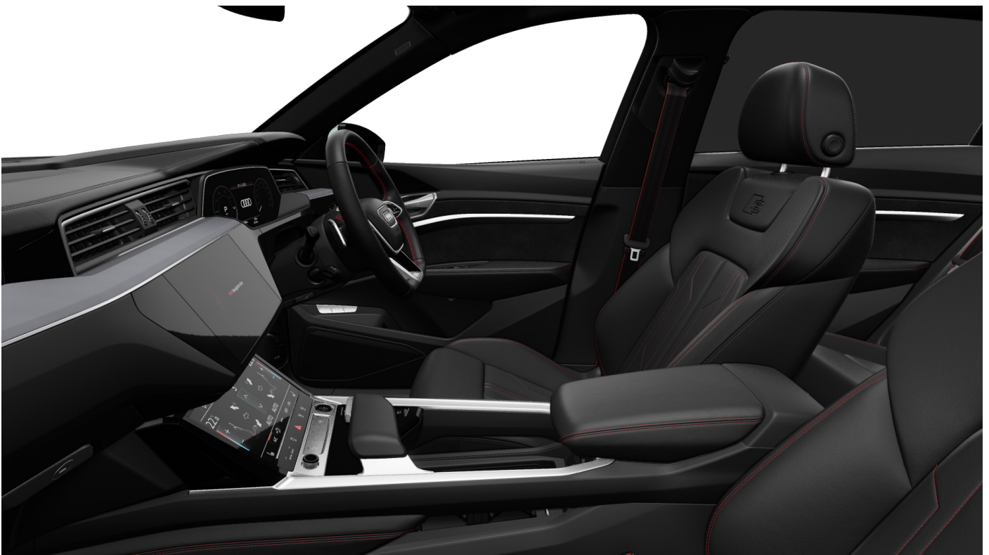
Black-Red/Black Leather Interior (Option Code VA)