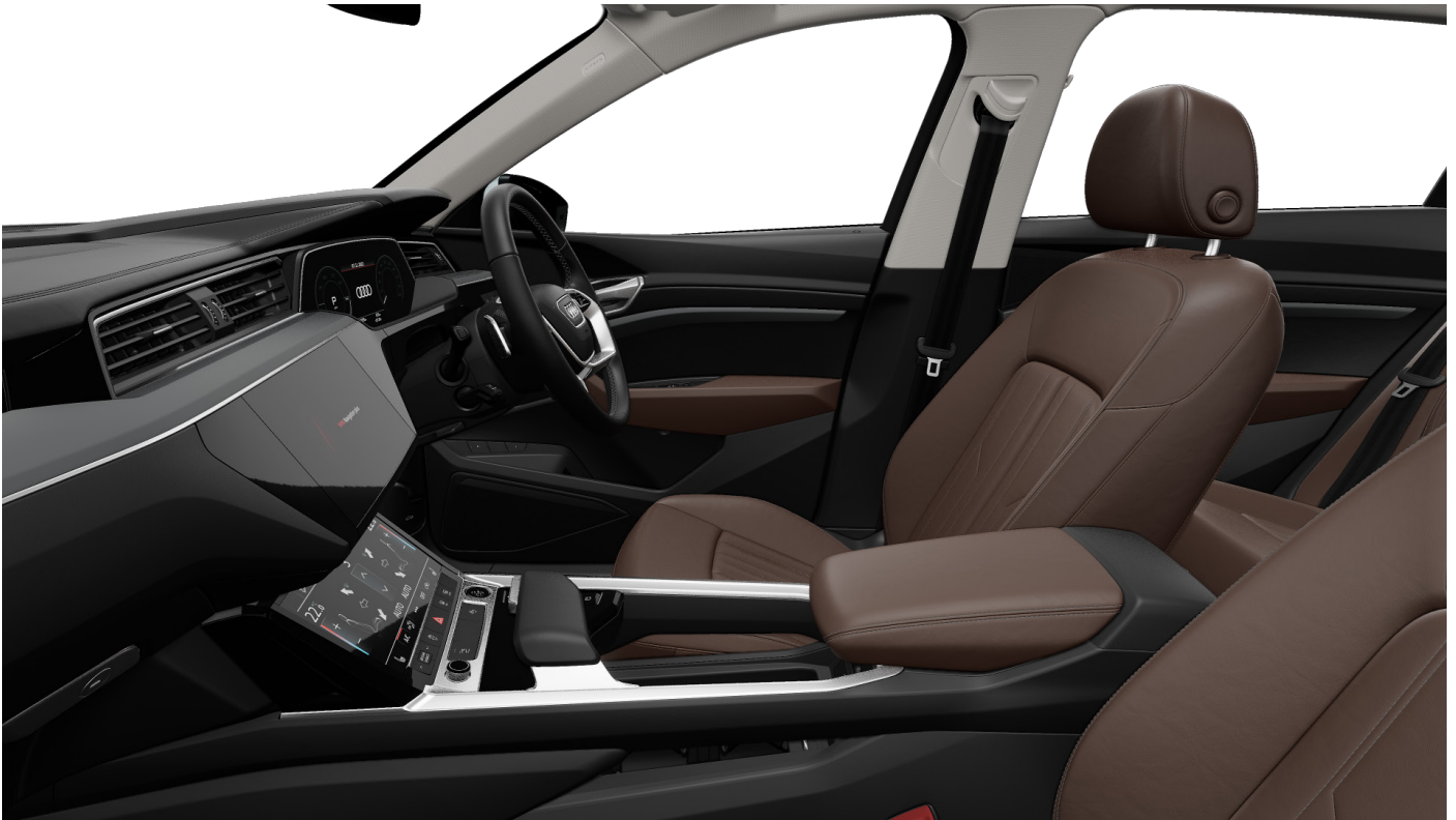
Brown-Grey/Black Leather Interior (Option Code MN)