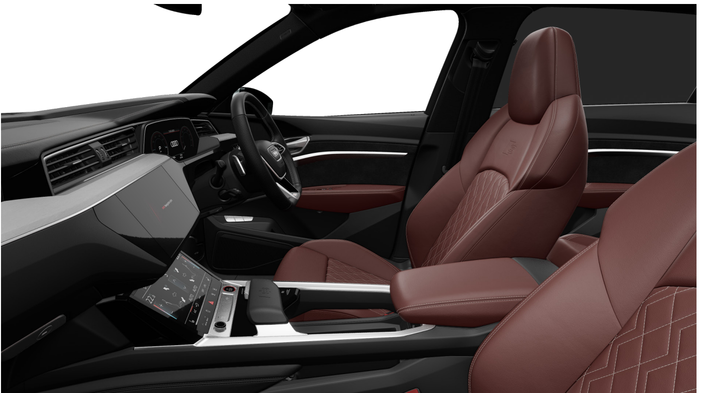
Arras Red-Agate Grey/Black Leather Interior (Option Code MD)