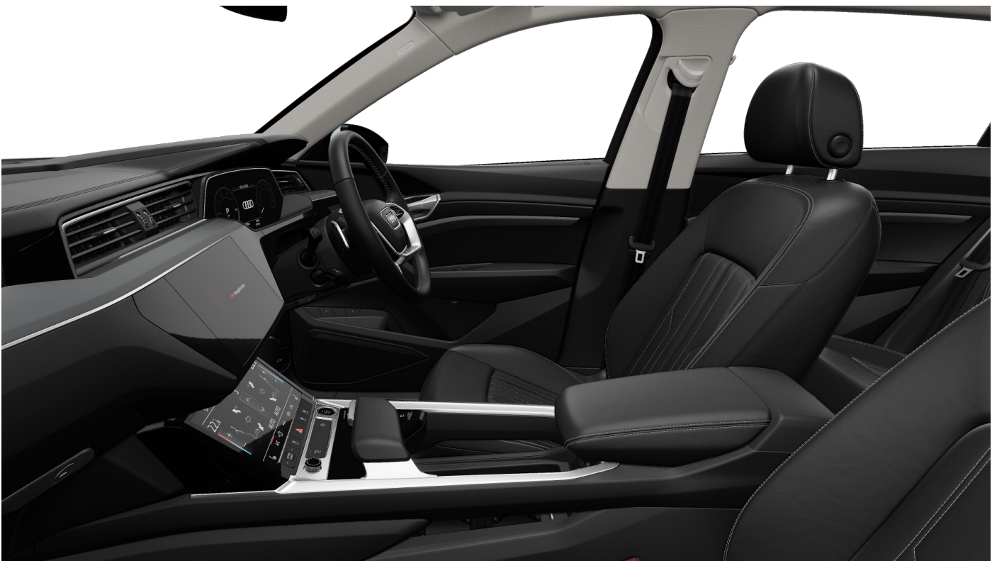
Black-Grey/Black Leather Interior (Option Code MP)