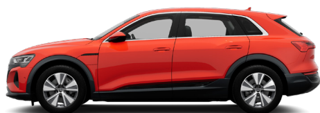
Soneira Red Metallic G1G1 €1,348