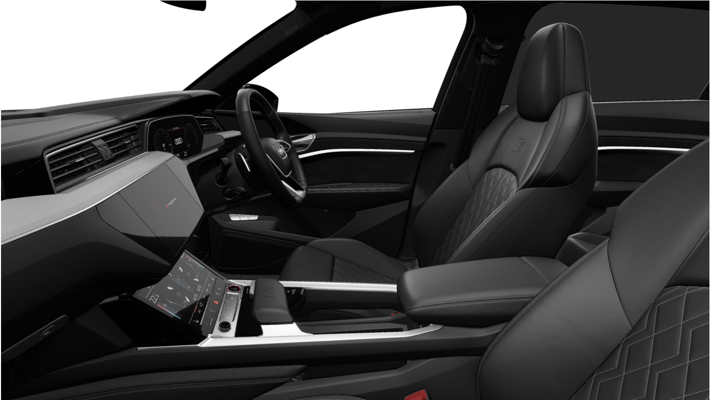
Black-Grey/Black Leather Interior (Option Code MP)