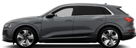
Daytona Grey Pearl Effect 6Y6Y 2 €1,348