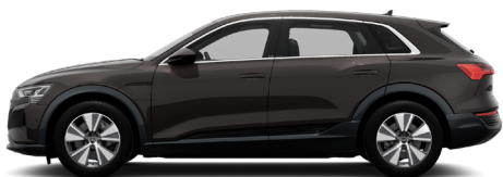
Madeira Brown Metallic 9E9E €1,348