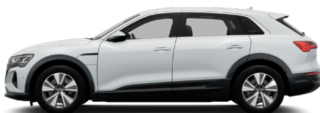
Glacier White Metallic 2Y2Y €1,348