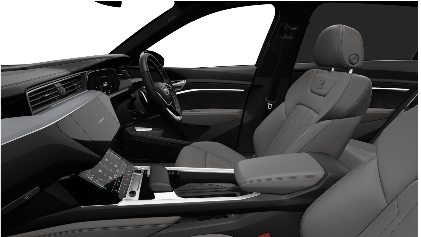
Rotor Grey-Anthracite/Black Leather Interior (Option Code TJ)