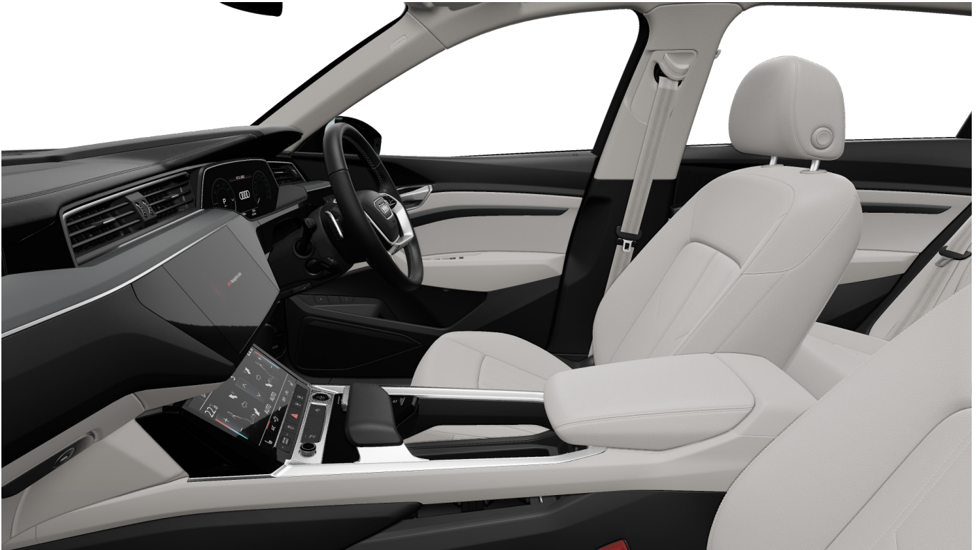
Beige-Grey/Grey-Beige Leather Interior (Option Code HQ)