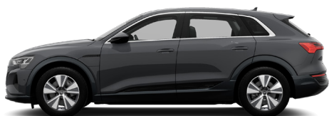
Magnet Grey Solid G5G5 €0