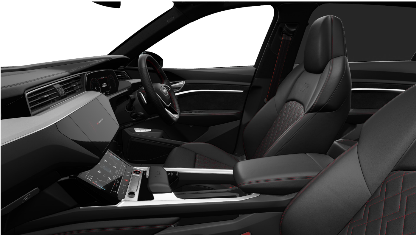
Black-Red/Black Leather Interior (Option Code VA)