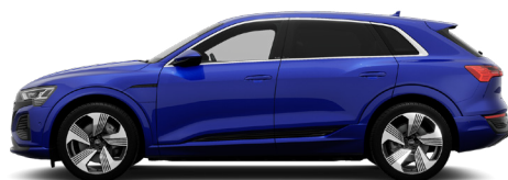
Ultra Blue Metallic 6I6I 2 €1,348