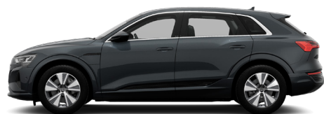
Manhattan Grey Metallic H1H1 1 €1,348