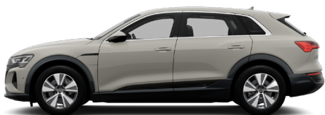
Siam Beige Metallic 7M7M 1 €1,348