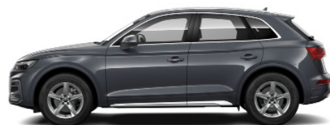
Manhattan Grey H1H1 Metallic €1,154