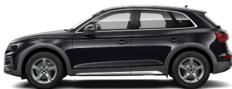
Brilliant Black A2A2 2 Solid €0