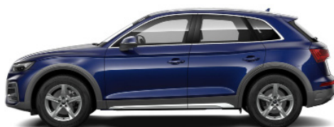
Navarra Blue 2D2D Metallic €1,154