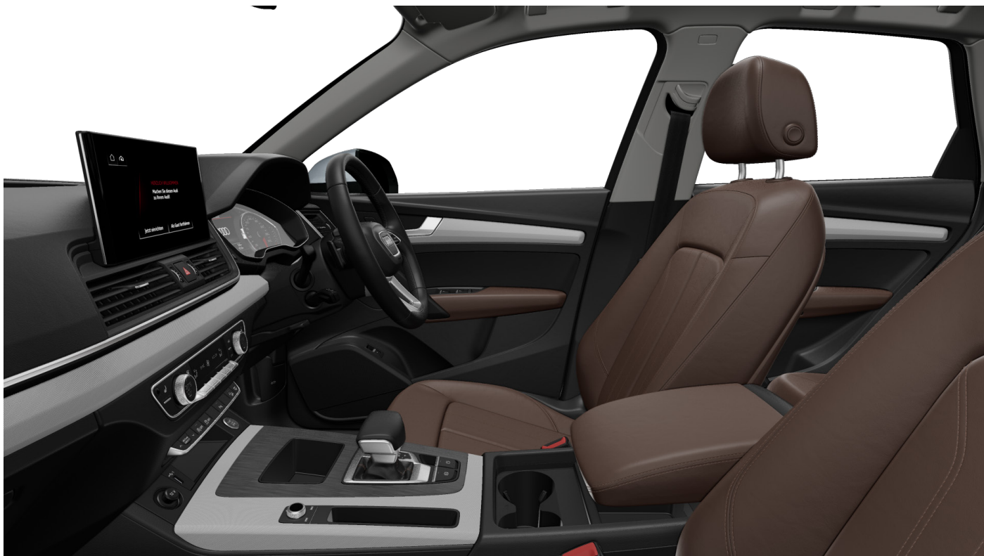
Okapi Brown/Black Leather Interior (Option Code BC)