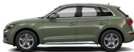
District Green M4M4 Metallic €1,154