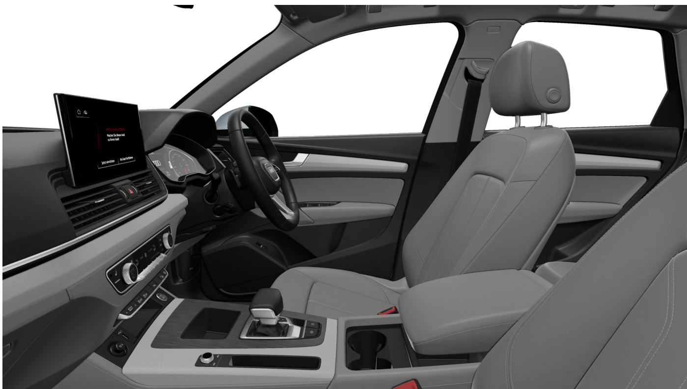
Grey/Black-Grey Leather Interior (Option Code EA)