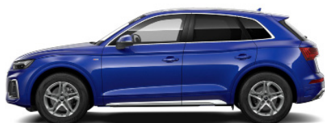
Ultra Blue 6I6I 1 Metallic €1,154