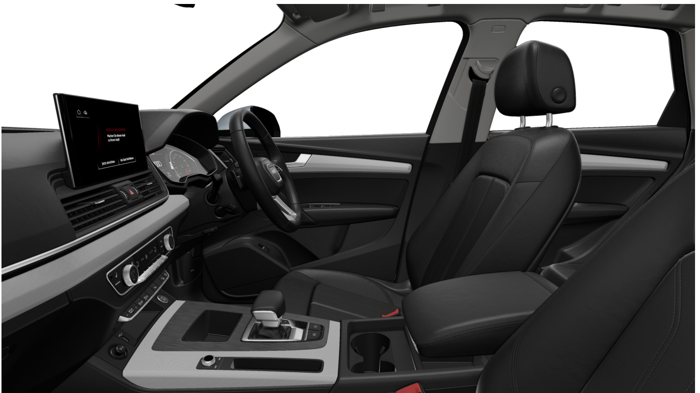
Black/Black Leather Interior (Option Code YM)