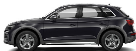
Mythos Black 0E0E Metallic €1,154