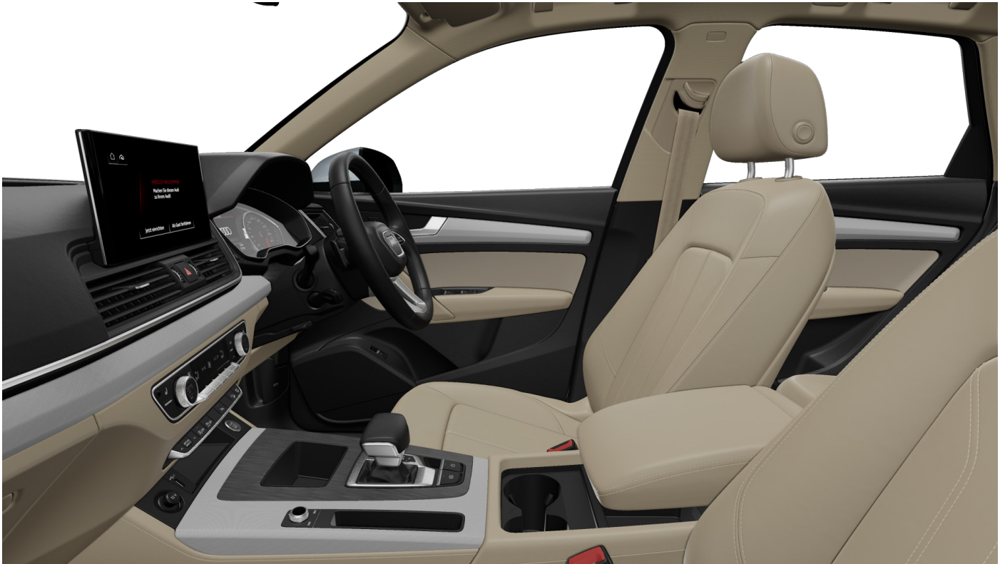
Beige/Black-Beige Leather Interior (Option Code EL)