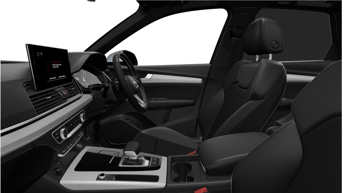
Black-Rock Grey/Black Sequence Cloth/Leather Combination Interior (Option Code EI)