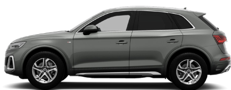
Chronos Grey T7T7 1 Metallic €1,154