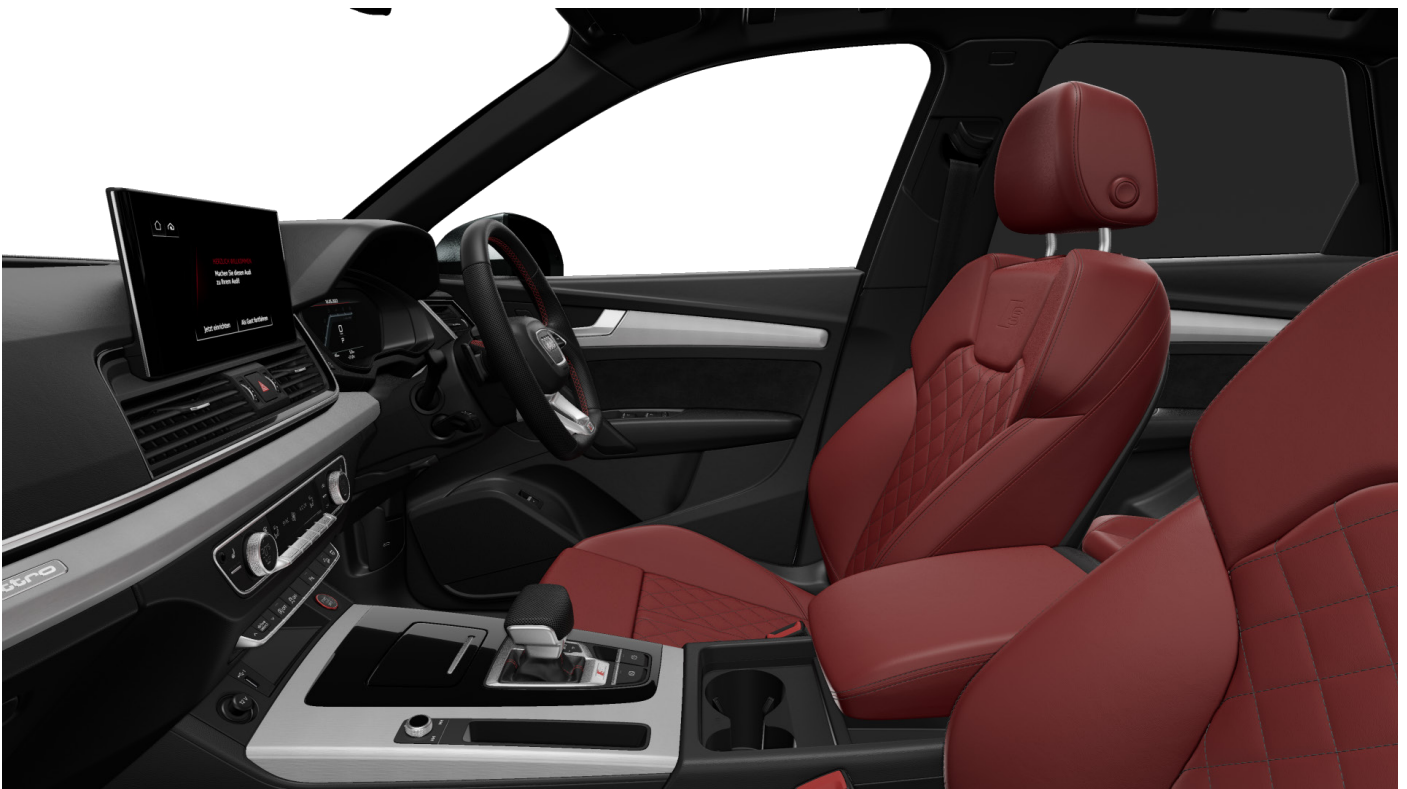
Rotor Grey/Black Sequence Cloth/Leather Combination Interior (Option Code AU)