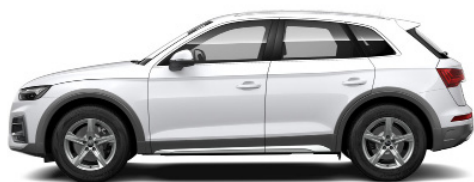
Arkona White Z9Z9 Solid €0