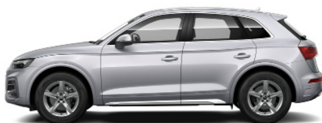
Floret Silver L5L5 Metallic €1,154