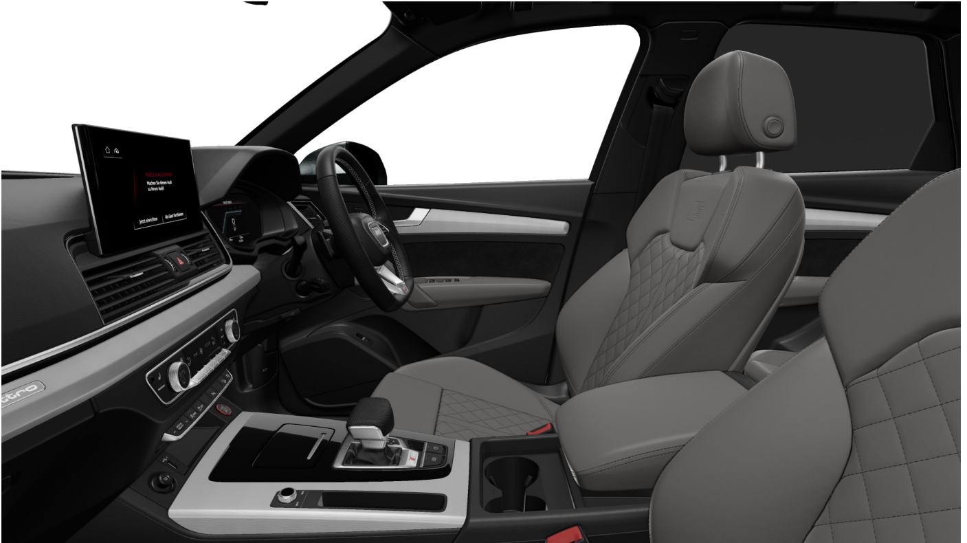
Rotor Grey/Black Leather Interior (Option Code OQ)