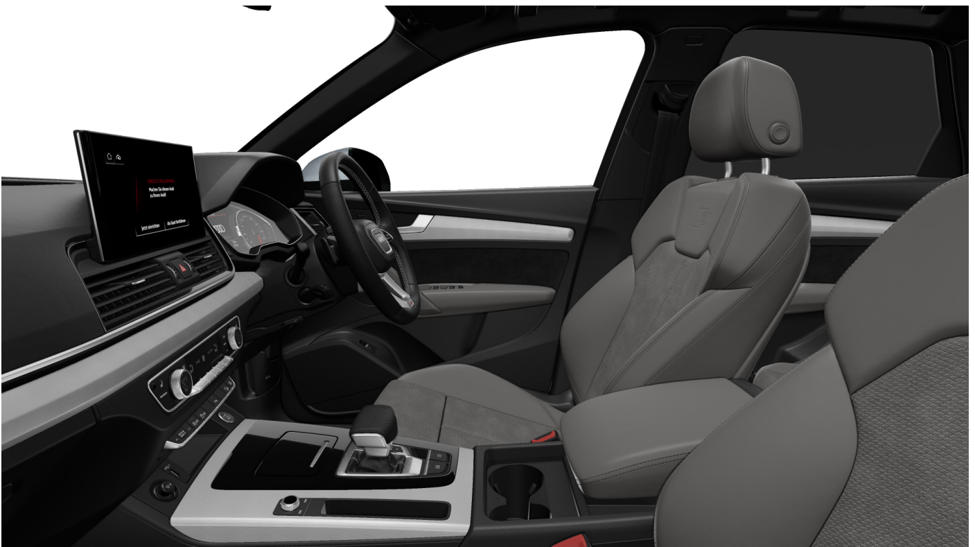
Rotor Grey/Black Sequence Cloth/Leather Combination Interior (Option Code OQ)