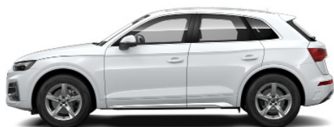
Glacier White 2Y2Y Metallic €1,154